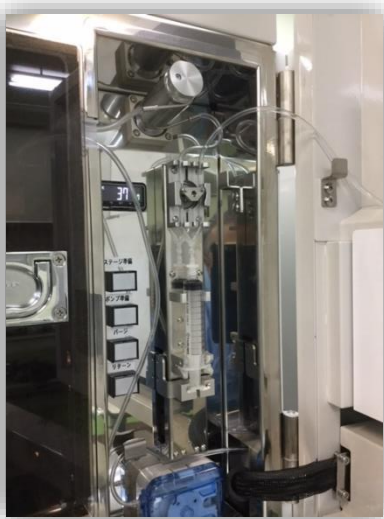
Rapid Temp. Medium Supply Unit